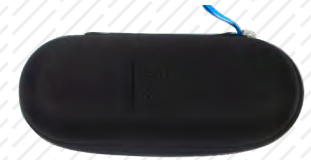
a Semi hard zippered case