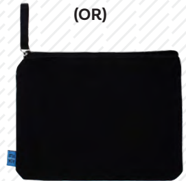
b Canvas zippered bag