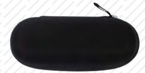
a Semi hard zippered case