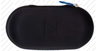
a Semi hard zippered case