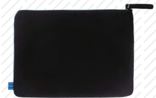
b Canvas zippered bag