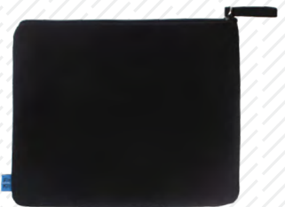
b Canvas zippered bag